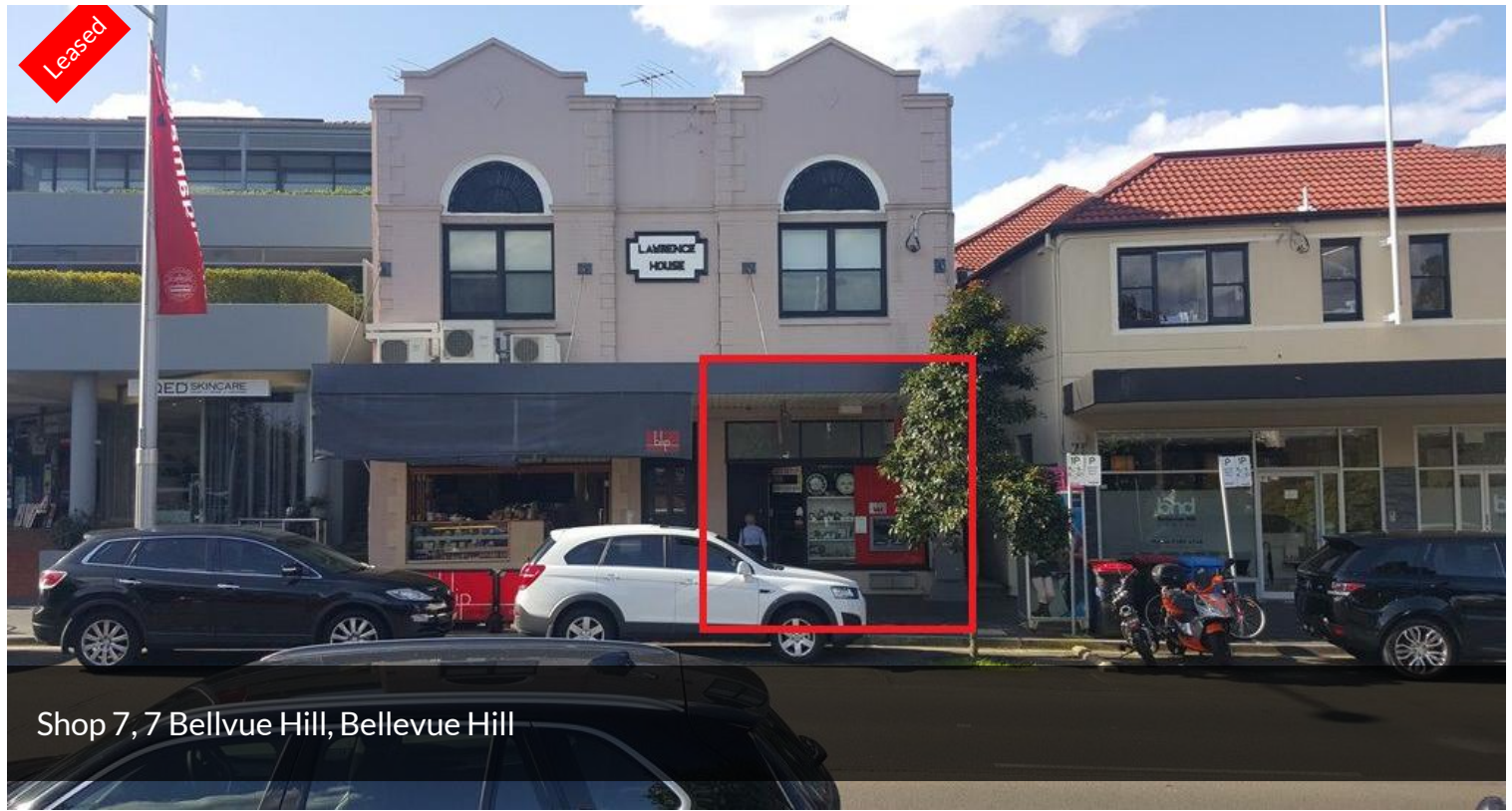
Shop 7, 7 Bellvue Hill, Bellevue Hill