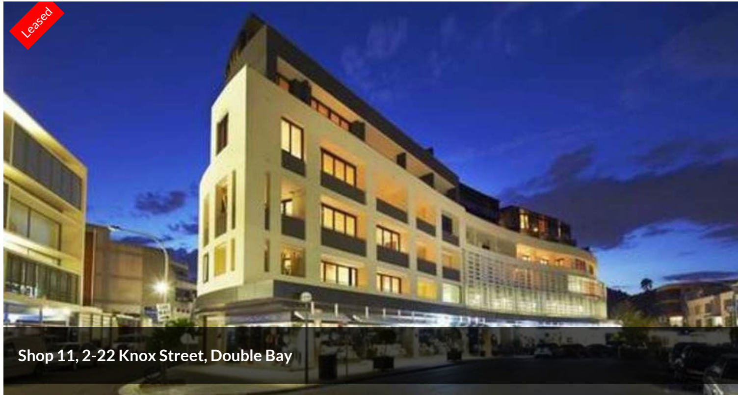
Shop 11, 2-22 Knox Street, Double Bay