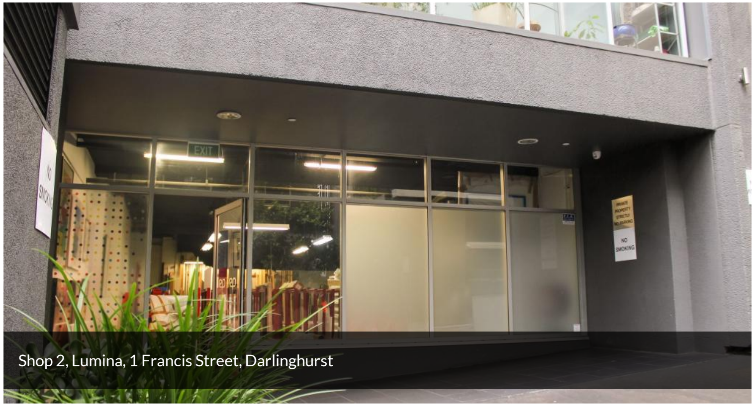
Shop 2, Lumina, 1 Francis Street, Darlinghurst