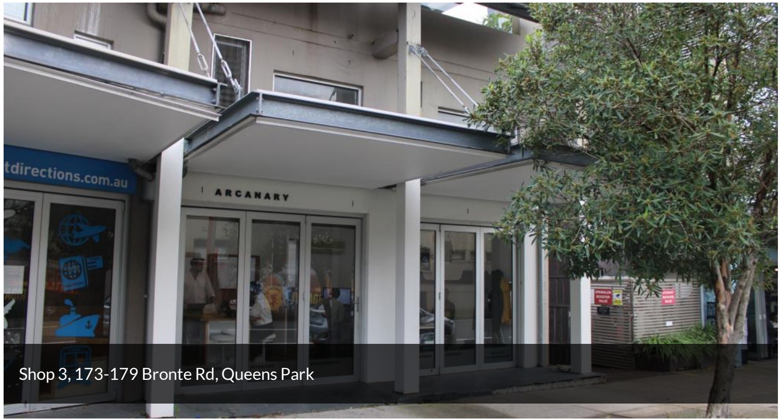
Shop 3, 173-179 Bronte Rd, Queens Park