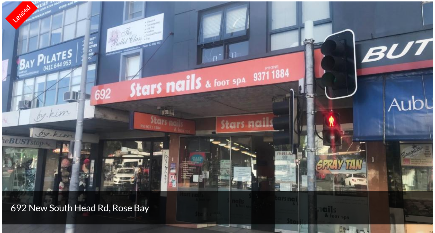
692 New South Head Rd, Rose Bay