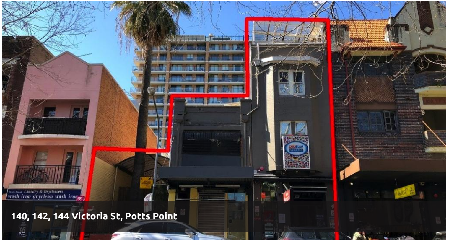
140, 142, 144 Victoria St, Potts Point