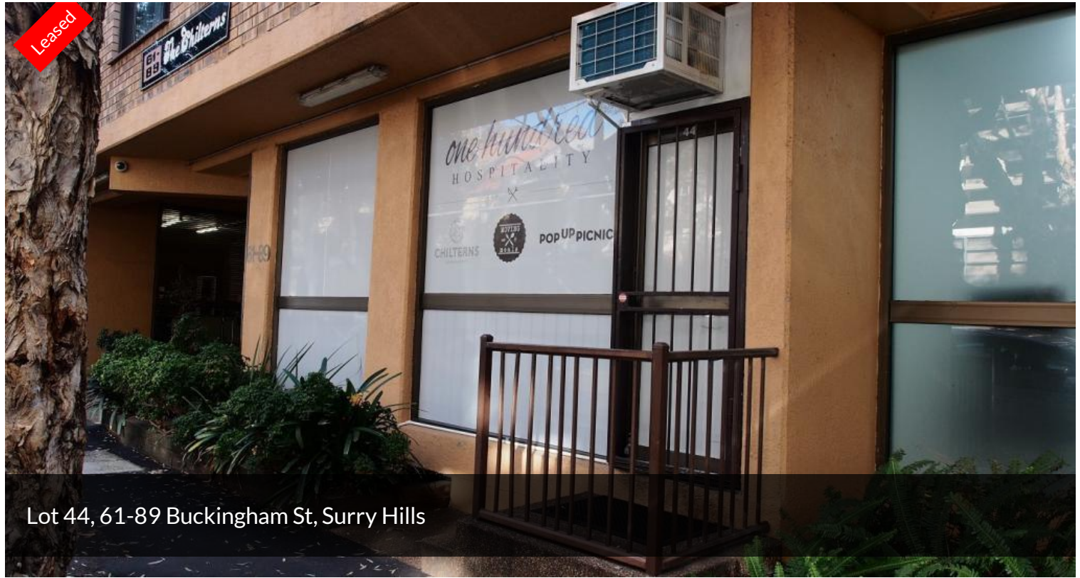
Lot 44, 61-89 Buckingham St, Surry Hills