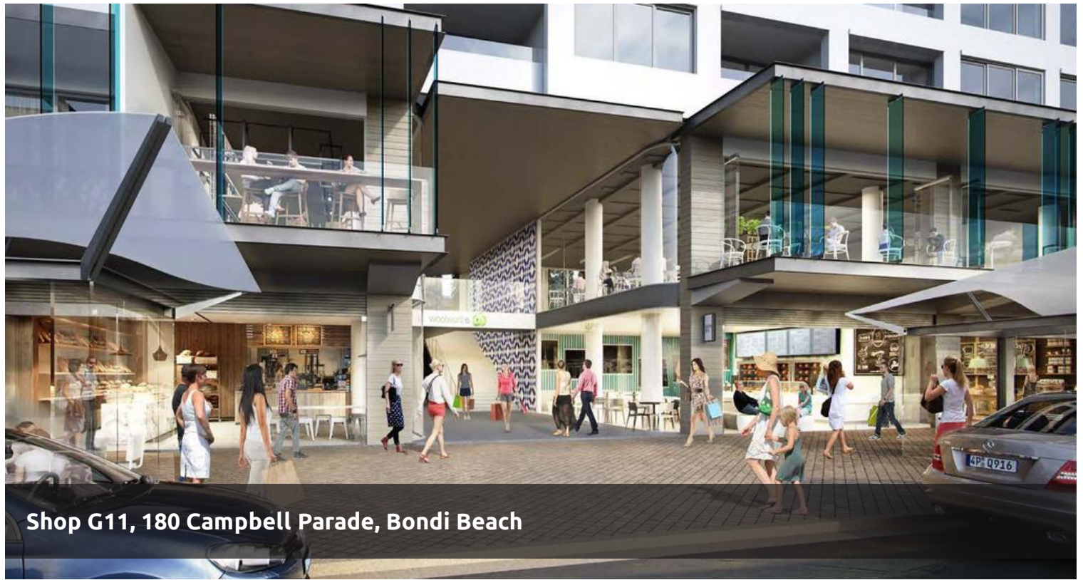
Shop G11, 180 Campbell Parade, Bondi Beach